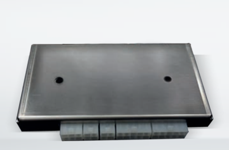
Computer unit in the central electrical system